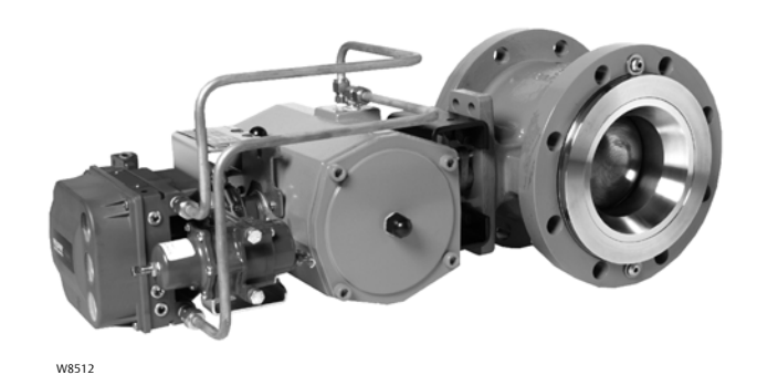
Fisher V150S Slurry Vee-Ball Control Valve

■ Long Service Life—The Vee-Ball design, when used in reverse flow mode, keeps the high velocity down stream of the vena contracta within the flow ring bore at the outlet of the valve. Compared with other styles of valves, the exit flow is essentially parallel with the flow ring wall and a minimum of flow impingement occurs. Combined with a choice of hard wear-resistant materials, a significantly long life is obtained.