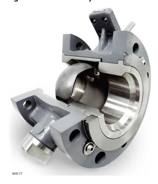
Figure 1. V150S Cutaway View